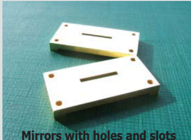
Mirrors with holes and slots