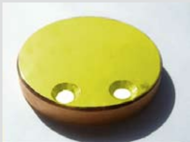
Gold mirror with 2 holes